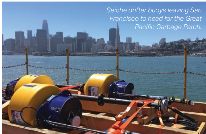
Seiche drifter buoys leaving San Francisco to head for the Great Pacific Garbage Patch.