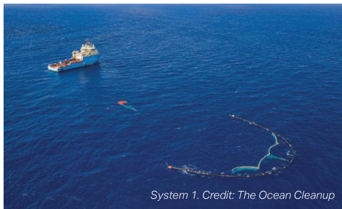
System 1.